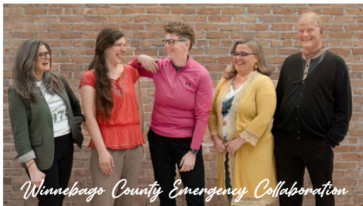
Winnebago County Emergency Collaboration

United is the Way we can continue helping area nonprofits and programs build capacity and expand their reach.