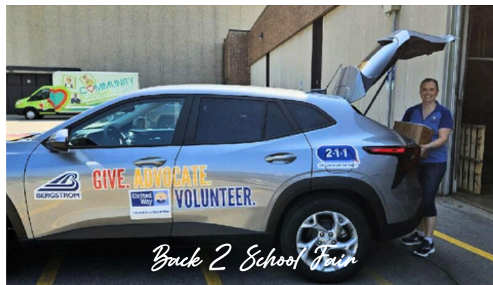
Back 2 School Fair