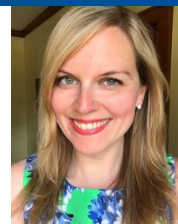
Annie Elmer Reff Baivier Lim Muza Sundet & Dunham, S.C.